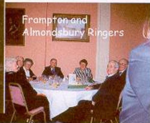
Frampton and Almondsbury Ringers

Bristol Rural Bristol Diocesan Association of Church Bell Ringers May 2000 No 04-00 News