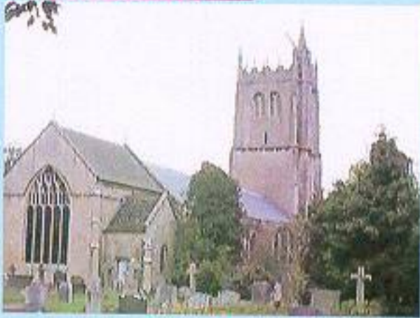
September 9th Mangotsfield