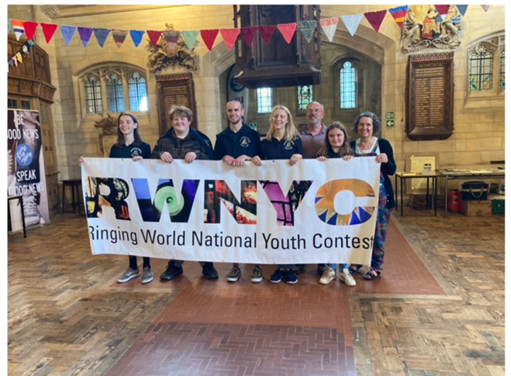
Bristol Rural Branch ringers