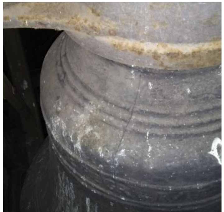
The crack in the crown of the Syston 4th

"While attending to the No. 4 clapper it was found that there were cracks in the crown of the bell. The first crack