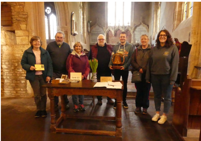
The winning team with the judge

The final ranking, in reverse order, was: