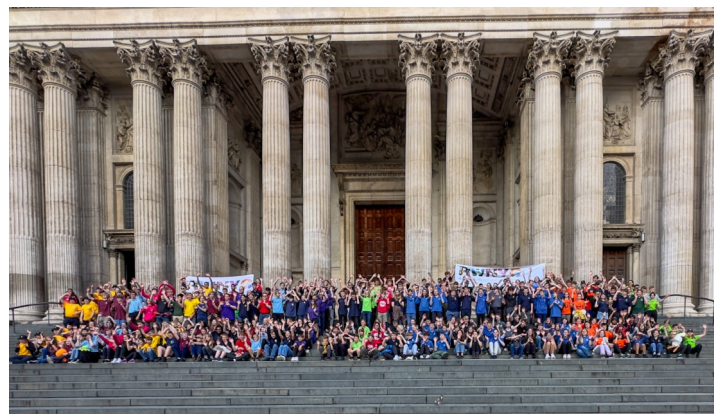
At St Pauls

The G&B youth team practice regularly throughout the year at numerous towers within the association. They can be contacted via the G&B website.