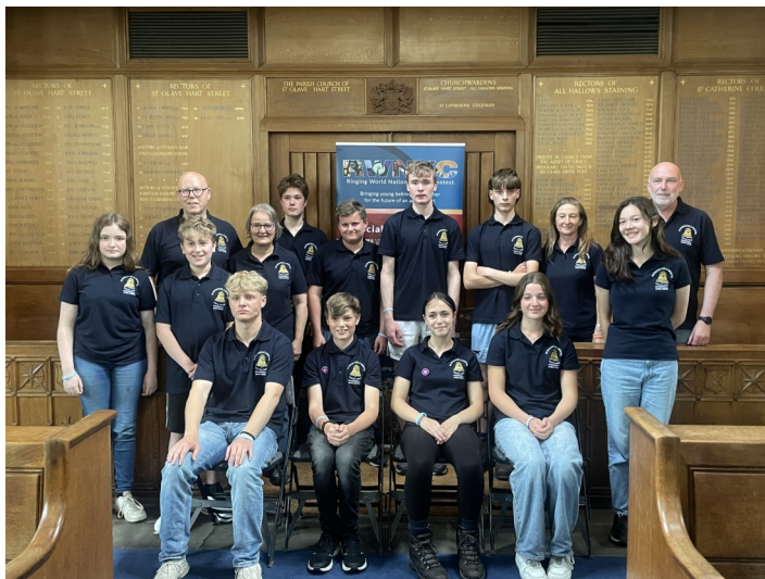
The G&B Youth Team

All 36 teams congregated at St Pauls Cathedral for the results ceremony. The G&B team were ranked joint 3rd in the 8 bell method group, where all young ringers received a medal for their efforts. Bristol Rural Branch were represented by 2 young ringers, 1 in the 8 bell team, and the other as reserve.