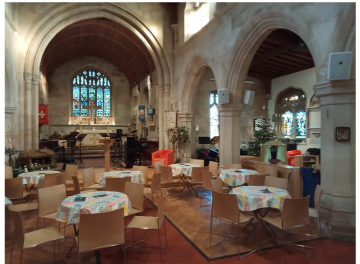
St. Katharine's, Holt

South Wraxall, a nice ground floor 7 ½ cwt six with the bell ropes arranged in a circle around the font in the west end tower. On a cold morning, it was especially welcoming to have the heating on! As usual we started with tea, coffee and biscuits before getting down to some nice ringing. The next stop was St. Michael and All Angels Melksham, a 1925 18 cwt Taylor's eight that went very well but perhaps not our best ringing. Fighting our way out of the town through the traffic was a bit of a pain, but we soon arrived at The Old Ham Tree at Holt which was our lunch stop for the day. The beer, food and conversation were all good – there's always time for plenty of talking – before we walked a couple of hundred yards to St. Katharine's Holt, a 9 cwt six, for our final ring of the day. The steep, narrow stairs were a challenge, but the bells themselves rang very well. It was