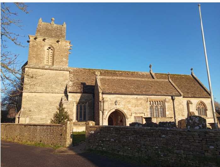
St. James, South Wraxall

After what seems like weeks of wet and gloomy weather, especially depressing at this time of year when daylight is in short supply anyway, it was good to wake up to a bright, sunny and cold January morning for the first Far-cited outing of the year. The first tower was St. James