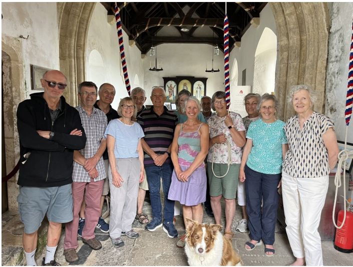
The far-cited ringers