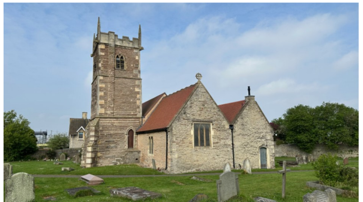
St. Michael’s church