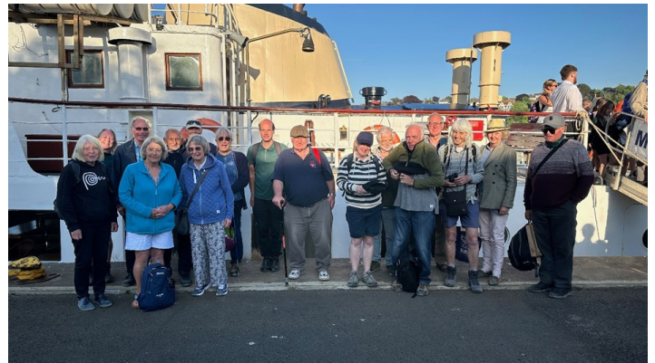
By the Lundy ferry

After lunch we had a second session of ringing before heading back down the slope to catch the boat back to Bideford. Another smooth crossing, with some of us spotting three dolphins swimming a short distance from the boat. After a final photoshoot beside the boat, it was time to eat before the final two towers the next day (Swimbridge, Filleigh) as we travelled home.