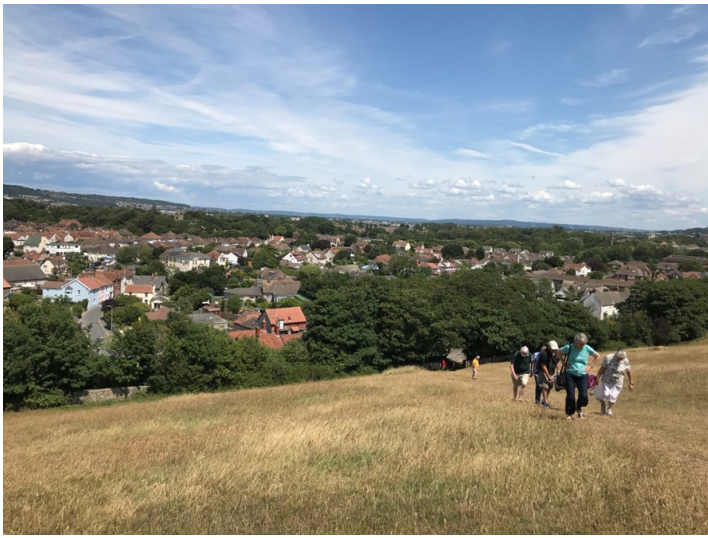
The climb to Uphill church