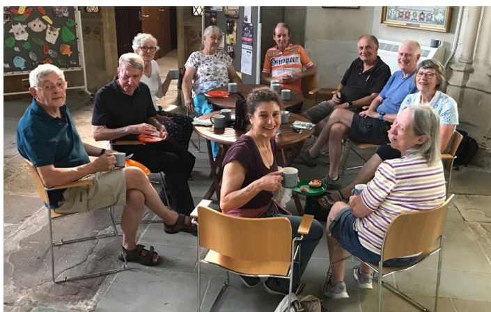
Relaxing over a cuppa and a chat

The traditional Bristol Rural Cream Tea Practice found a new venue last month as St Mary's Thornbury opened its doors and extended a warm welcome to 20 ringers from around our region. Our wonderful new servery was admired and put to good use providing everything we needed for perfect refreshments in style.