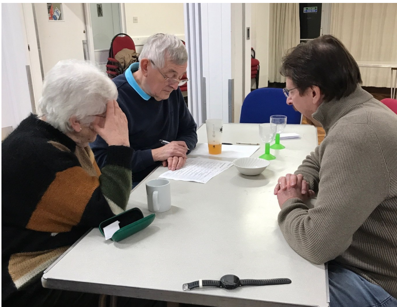
"Frenchay 5" minus a few team members